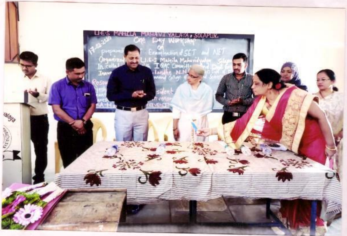
Felicitation of chief guest on NET/SET workshop.