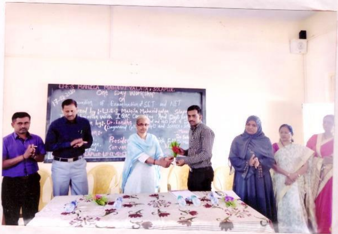
felicitation of chief guest.