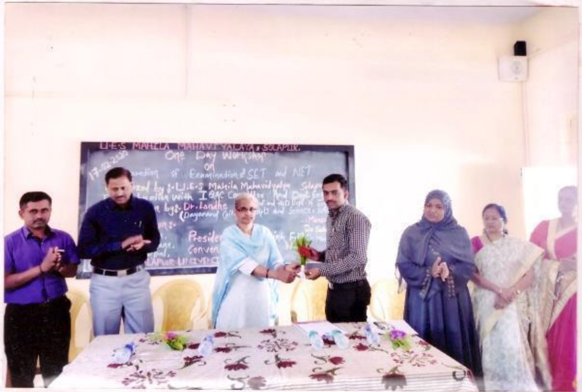
Felicitaton of chof Guest.