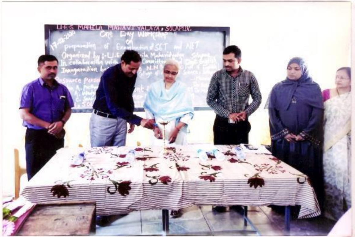
Preparation of Examination SET/NET